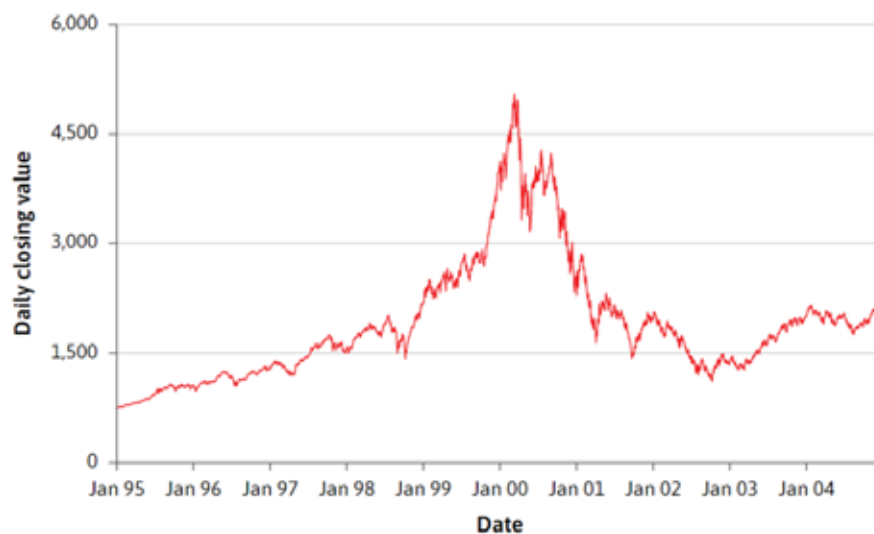
Figure 3.1 The tech bubble: Nasdaq Composite Index (1995–2004).

Share prices are not only volatile hour-by-hour and day-by-day. They can also display large swings, often referred to as bubbles. Figure 3.1 shows the value of the Nasdaq Composite Index between 1995 and 2004. This index is an average of prices for a set of stocks, with companies weighted in proportion to their market capitalization. The Nasdaq Composite Index at this time included many fast-growing and hard-to-value companies in technology sectors.